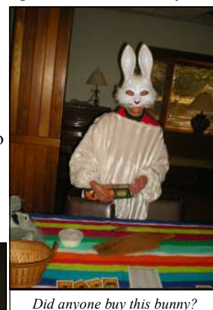
Did anyone buy this bunny?