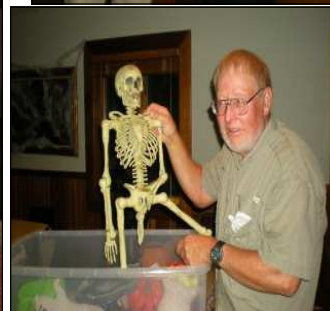
Do not ask if he is Sampras!